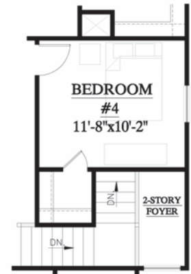
OPTIONAL BEDROOM #4